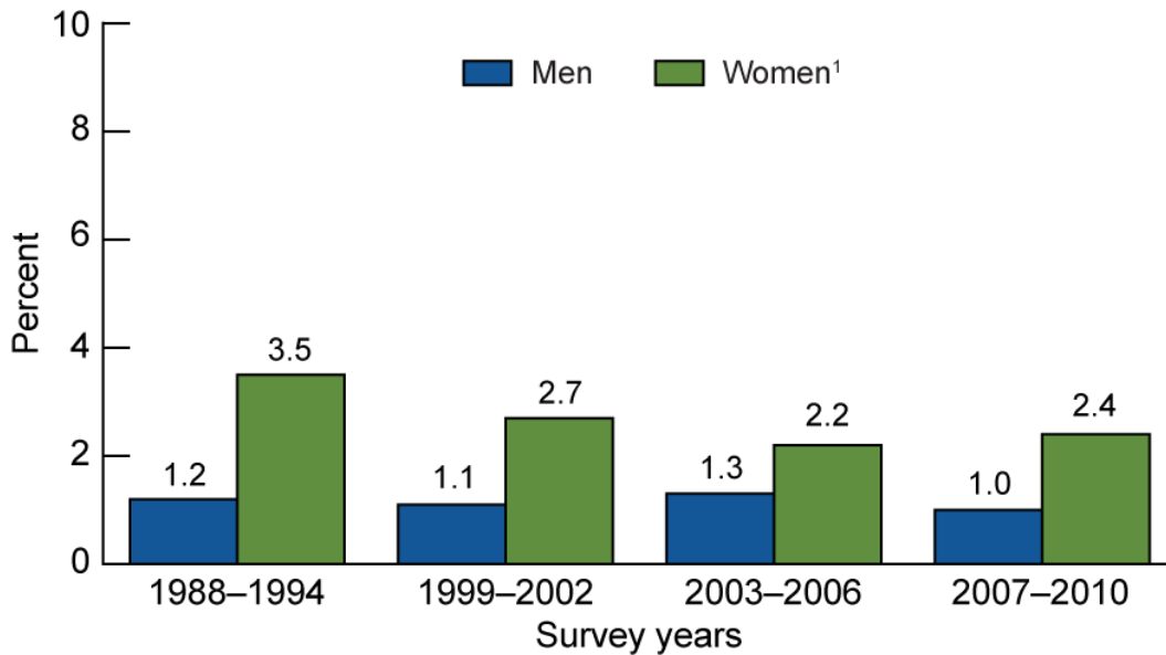
Figure 1. Prevalence of underweight among adults aged 20 and over, by sex: United States, 1988–1994 through 2007–2010