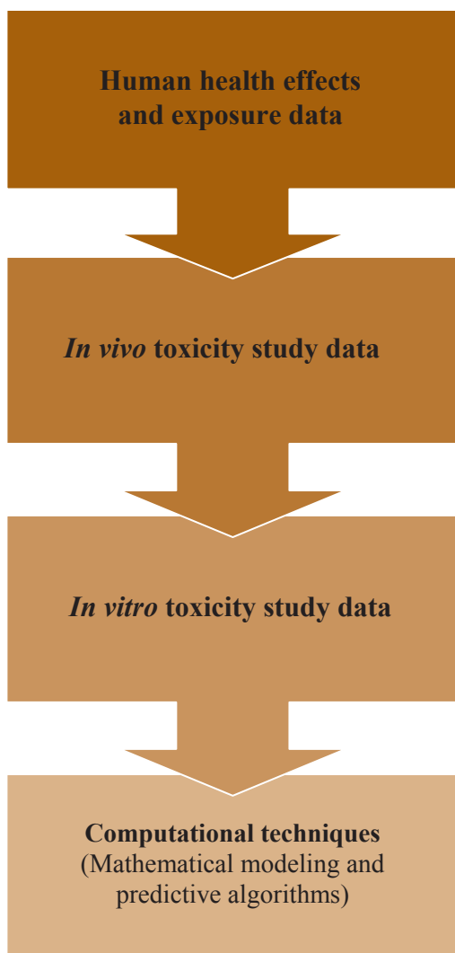
Figure 2. Hierarchy of evaluated scientific data

such as QSARs and the skin dose to inhalation dose ratio (SI ratio) (see Appendix B), should not be used as the primary basis for the assignment of a skin notation. Instead, they are intended only to serve as additional supportive data sources when limited data are available for the assignment of skin notations. As the computational techniques become more reliable and validated, NIOSH will reassess their use