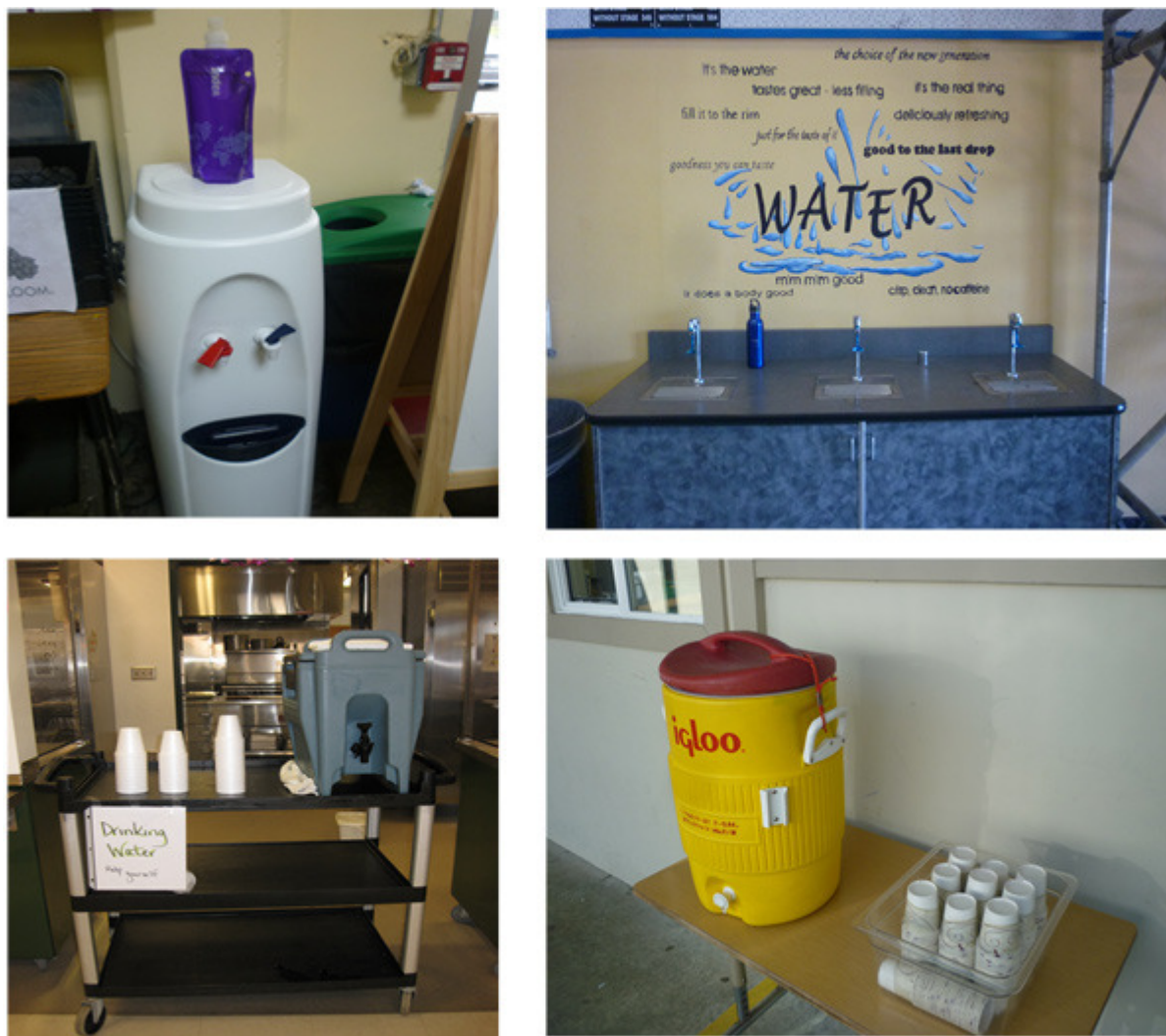
Figure 2. Alternative drinking water sources in Bay Area, California, food service areas. Top left, a hot and cold water dispenser found within 10 feet of where food was served in an indoor high school cafeteria. Resting on the dispenser is a purple Vapur-brand foldable reusable water bottle sold as a fundraiser by a student group at the school. Top right, a hydration station located approximately 50 feet of where food was served in an indoor high school cafeteria. Bottom left, a Cambro-brand cooler and foam cups located within 5 feet of where food was served in an indoor middle school cafeteria. Bottom right, an Igloo-brand cooler and Dixie-brand cups provided for students outdoors within 5 feet of a food service window but approximately 100 feet from the main cafeteria in a middle school.

Another high school installed a hydration station with a mural backplash displaying promotional messages to encourage water intake. The hydration station was installed by the food service director, a champion of health and nutrition. The cost of the station, estimated at $2,000, was paid for through the food services budget, which often covers ancillary costs (eg, trays, napkins) associated with meal service. Students at this school, similar to the school with a dispenser, were expected to bring their own containers for drinking water due to concerns about waste (eg, cups) not being discarded appropriately in trash receptacles.