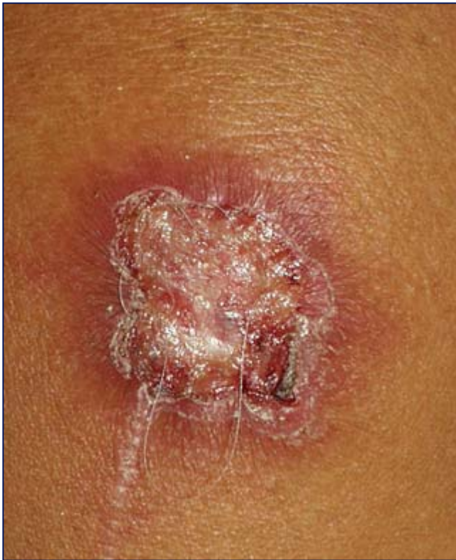
SHOULDER: 4 CM