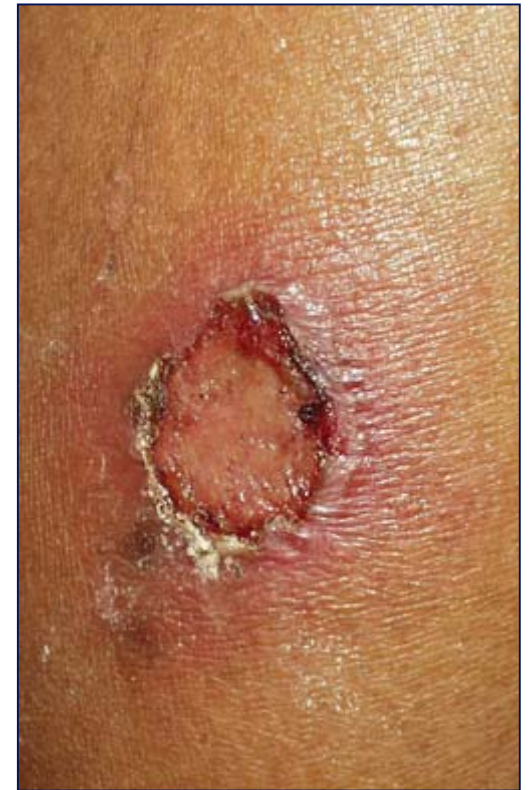
RIGHT CALF: 4 CM