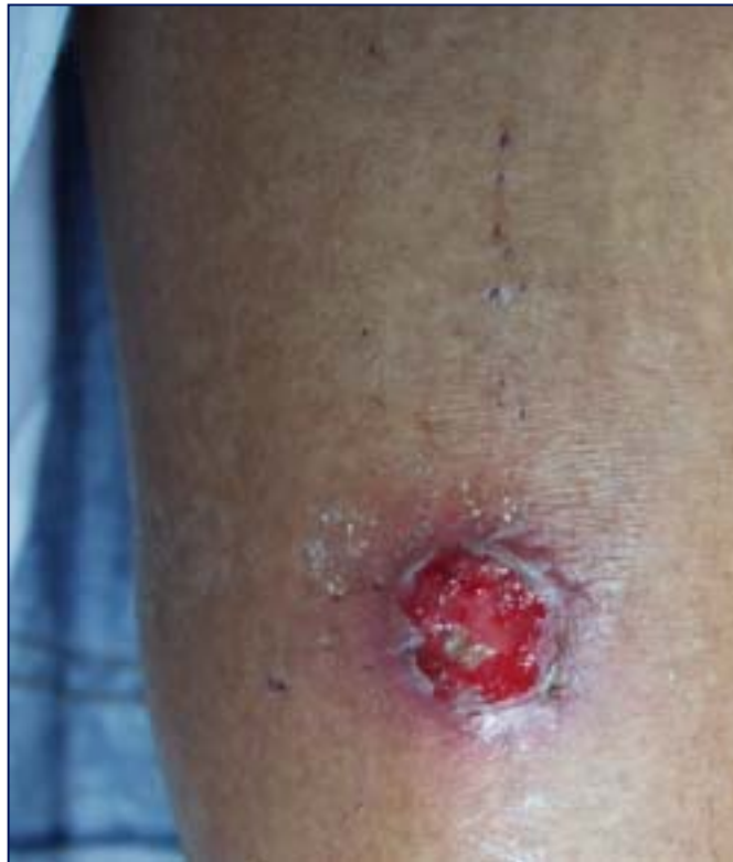
LEFT CALF: 3 CM