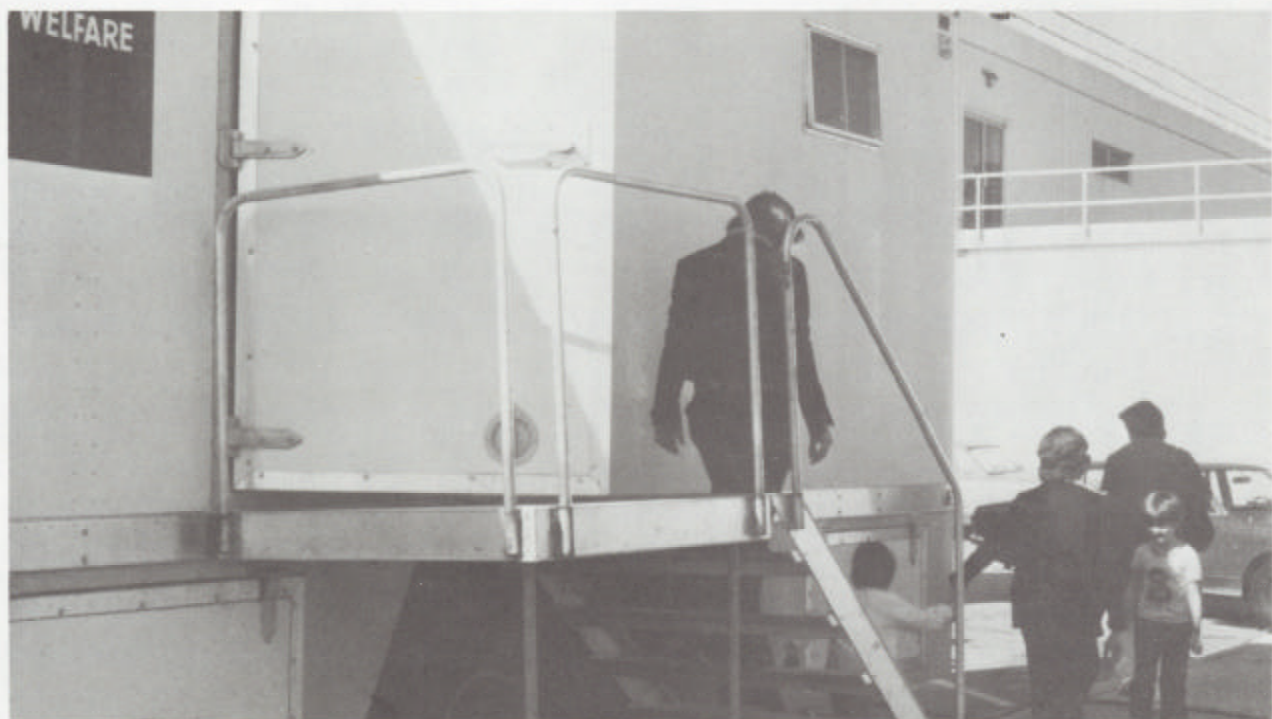
Over 62,000 Americans have taken part in the National Health and Nutrition Examination Surveys. Upcoming, a special survey of Hispanics.

core of statistical competence can be maintained in each State to support a number of Federal and State programs as well as other users of health data.