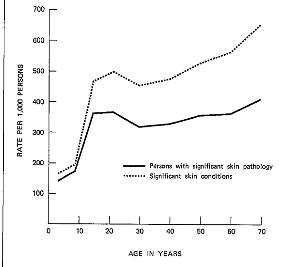
Figure 1. PREVALENCE RATES FOR SIGNIFICANT SKIN PATHOLOGY AND PREVALENCE RATES OF SIGNIFICANT SKIN CONDITIONS AMONG PERSONS 1-74 YEARS BY AGE: UNITED STATES, 1971-74.