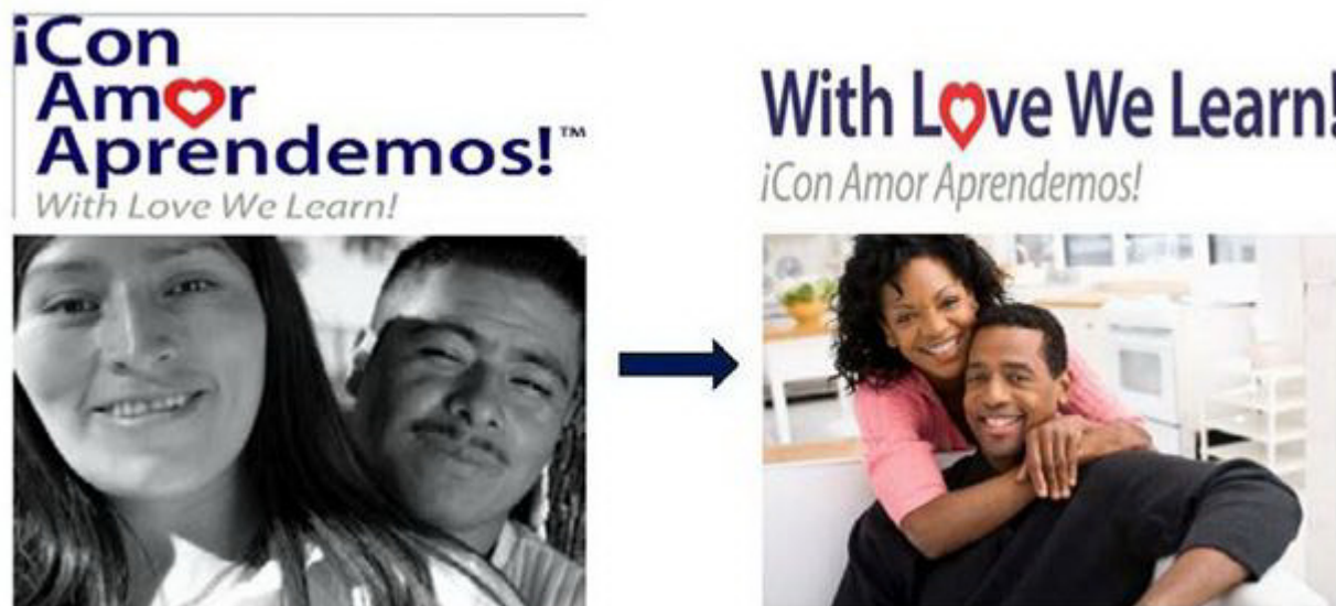
Figure 2. Changes to Con Amor Aprendemos for the Cover of With Love We Learn Manual, Atlanta, Georgia, 2012. [A text description of this figure is also available.]

Overall, the program was well received by church leaders, trainers, and participants of the pilot intervention. Each phase of the adaptation process included valuable recommendations for the WLWL curriculum (Figure 2). Suggestions for content tailoring included changes to the cover, games related to session topics, pictures to reflect African Americans, and more effective dialogue to deliver the content of the sessions to an African American population. The modification of relevant health statistics addressing screening rates and cervical cancer mortality for African American women was also critical to effectively communicate risk data to participants. Other modifications included recommendations for stratifying the program by age groups to promote easier conversations with peers closer in age. The frequency of the sessions was condensed to twice a week for 3 weeks to retain members' participation throughout the program (Table 3). Core elements of the program, including the session topics and the use of games, pictures, posters, and dialogues for learning the material, were not changed. Although these materials were welcomed and reported to be helpful in learning, suggestions were given to make them relevant to both younger and older African American audiences in the community. The program developer, a gynecologist, and other program staff reviewed the comments and modified the pilot WLWL curriculum.